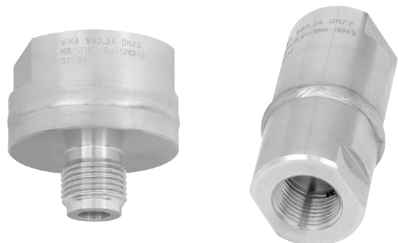
Model 990.34 Mb 40 mm thread G ½ B (male)