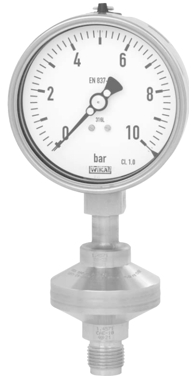
Diaphragm Seal Model 990.34, Mb 52 mm process connection thread G ½ B (male), with Pressure Gauge Model 232.50 NS 100

See also diagram pressure-temperature rating on page 3