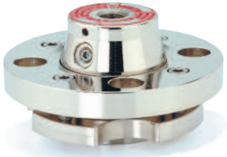
TYPE 403 SHOWN